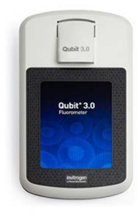
Figure 1. Qubit® assay workflow